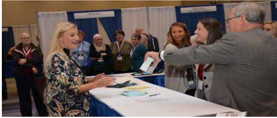
Exhibit Hall Prizes: Encourage attendance in the Exhibit Hall by donating to the "BIG" prize drawing. "BIG" prizes will be awarded from the Ohio Pharmacists Foundation (OPF) booth and contributing companies will be recognized. Since attendees must visit your booth to qualify to enter the drawing, you will meet and greet hundreds of Ohio pharmacists and student pharmacists. In 2020, OPA attendees had a chance to win pharmacy prints, one $250 gift card & many other gift cards.