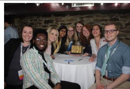
2019 Student Olympics Winners University of Toledo