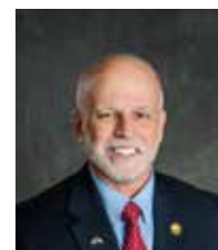
Sen. Kyle Koehler (R-Springfield)