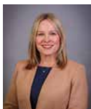
Rep. Kellie Deeter (R-Norwalk)