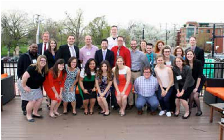
At the 2015 OPA Annual Conference, NPX members and OPA members pause for a photo during the NPX Social networking event at The Social bar in Columbus.

Members of NPX now receive a quarterly e-newsletter which highlights OPA events, areas in Ohio, healthy and delicious recipes, and the great work of our OPA committees. We also host social and networking events, which allow our new practitioners chances to share similar stories