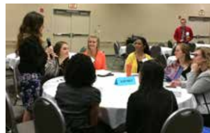
New practitioners engage students in discussions on finance and career preparation.

Supported by Rite Aid Pharmacy, WalMart Stores and Giant Eagle Pharmacy